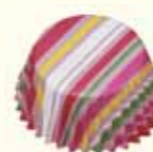
PTC05030 [4798824] PET cup (stripe/pink)