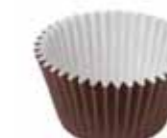
SWC255 [1500055] Inner cup (brown)