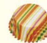
PTC05030 [4798825] PET cup (stripe/orange)