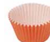
SWC254 [1500054] Inner cup (orange)