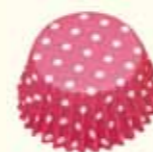
PTC05030 [4798820] PET cup (polka-dot/pink)