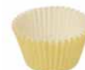
SWC252 [1500052] Inner cup (cream)