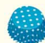
PTC05030 [4798822] PET cup (polka-dot/blue)