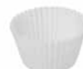
SWC251 [1500051] Inner cup (white)