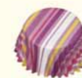
PTC05030 [4798827] PET cup (stripe/purple)