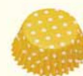
PTC05030 [4798821] PET cup (polka-dot/yellow)