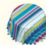
PTC05030 [4798826] PET cup (stripe/blue)