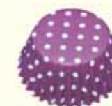
PTC05030 [4798823] PET cup (polka-dot/purple)