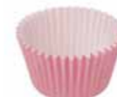
SWC253 [1500053] Inner cup (pink)